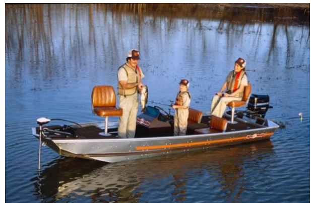
Delivering Value: Making fishing and boating affordable for 50 years Left: The first Bass Pro Shops store in Springfield, Missouri, USA. Right: The original Bass Tracker boat.