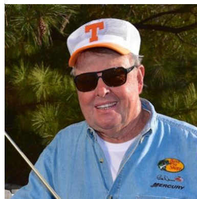
Legendary angler Bill Dance