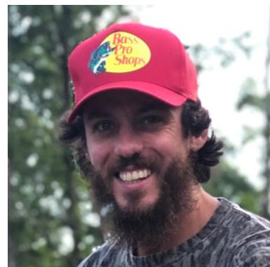
Country music star Chris Janson