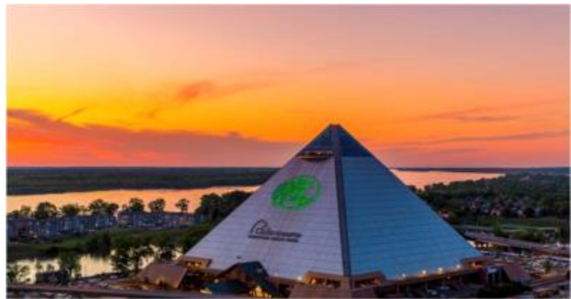
Bass Pro Shops at the iconic Memphis Pyramid stands more than 300 feet tall with a visitor observation deck at its apex.

Bass Pro Shops at the Pyramid, one of the most dynamic, immersive retail experiences in the world , opened in downtown Memphis in 2015. Located along the banks of the Mississippi River, Morris and his team transformed the massive sports arena into a national “must-see” experience for families and outdoor enthusiasts. In addition to a vast assortment of outdoor gear, the Pyramid includes a wilderness-themed hotel called Big Cypress Lodge, nearly 600,000 gallons of water features, a cypress swamp with 100-foot-tall trees, the interactive Ducks Unlimited National Waterfowling Heritage Center, and The Lookout, a glass-floored cantilevering observation deck at the top of the 32-story steel Pyramid. More than three million visitors experienced the Pyramid in its first year of operation.