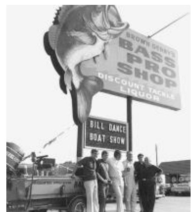
Legendary pro anglers Bill Dance, Johnny Morris and team at the original Bass Pro Shops store grand opening.