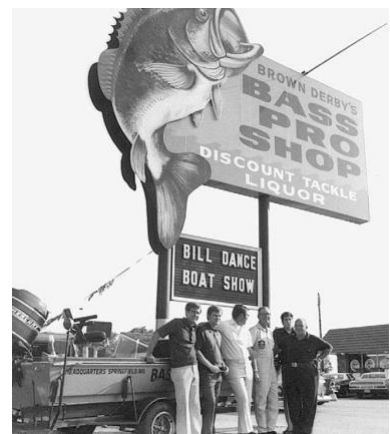
Legendary pro anglers Bill Dance, Johnny Morris and team at the original Bass Pro Shops store grand opening.