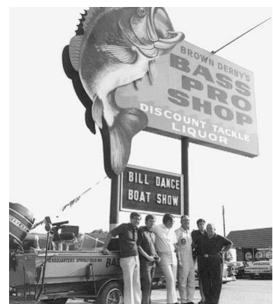
Legendary pro anglers Bill Dance, Johnny Morris and team at the original Bass Pro Shops store grand opening.