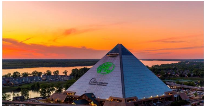
Bass Pro Shops at the iconic Memphis Pyramid stands more than 300 feet tall with a visitor observation deck at its apex.

Bass Pro Shops at the Pyramid, one of the most dynamic, immersive retail experiences in the world , opened in downtown Memphis in 2015. Located along the banks of the Mississippi River, Morris and his team transformed the massive sports arena into a national “must-see” experience for families and outdoor enthusiasts. In addition to a vast assortment of outdoor gear, the Pyramid includes a wilderness-themed hotel called Big Cypress Lodge, nearly 600,000 gallons of water features, a cypress swamp with 100-foot-tall trees, the interactive Ducks Unlimited National Waterfowling Heritage Center, and The Lookout, a glass-floored cantilevering observation deck at the top of the 32-story steel Pyramid. More than three million visitors experienced the Pyramid in its first year of operation.