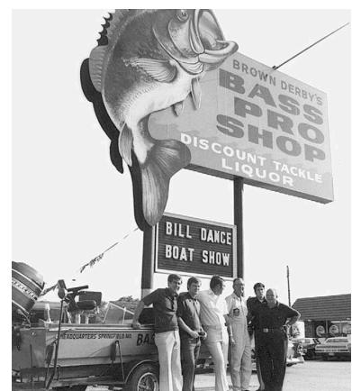
Legendary pro anglers Bill Dance, Johnny Morris and team at the original Bass Pro Shops store grand opening.