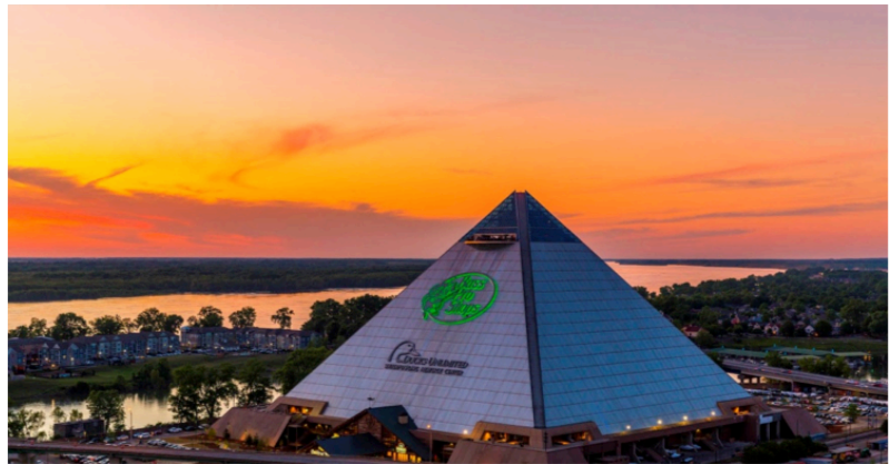
Bass Pro Shops at the iconic Memphis Pyramid stands more than 300 feet tall with a visitor observation deck at its apex.

Bass Pro Shops at the Pyramid, one of the most dynamic, immersive retail experiences in the world , opened in downtown Memphis in 2015. Located along the banks of the Mississippi River, Morris and his team transformed the massive sports arena into a national “must-see” experience for families and outdoor enthusiasts. In addition to a vast assortment of outdoor gear, the Pyramid includes a wilderness-themed hotel called Big Cypress Lodge, nearly 600,000 gallons of water features, a cypress swamp with 100-foot-tall trees, the interactive Ducks Unlimited National Waterfowling Heritage Center, and The Lookout, a glass-floored cantilevering observation deck at the top of the 32-story steel Pyramid. More than three million visitors experienced the Pyramid in its first year of operation.