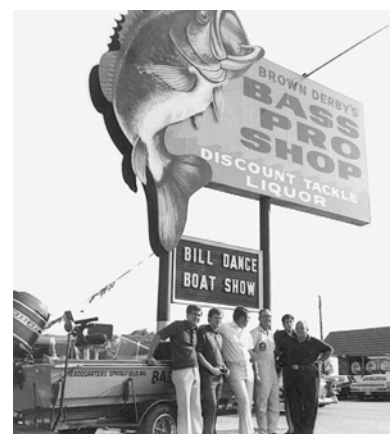
Legendary pro anglers Bill Dance, Johnny Morris and team at the original Bass Pro Shops store grand opening.